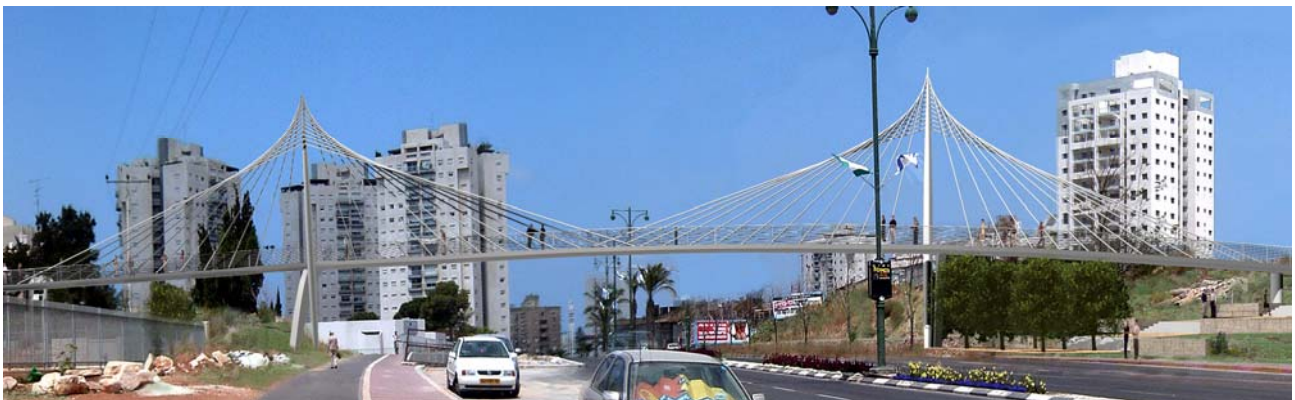
Project visualization of Giv'ataim Bridge

The bridge is slightly curved in plan with a cable-stayed main span of 51m and a total length of 240m. The deck is constructed from post-tensioned concrete while the cigar-shaped pylons are made from steel emphasising the seemingly floating appearance of this bridge.