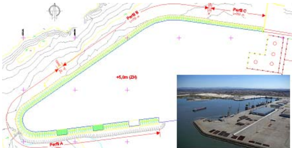
Plan view and photograph of the new port of Aveiro.

A new terminal for the handling of liquid goods was designed at the Portuguese port of Aveiro. Substantial landscaping earthworks had to be undertaken and three large concrete piers were designed. The piers were designed as reinforced concrete grillages which were cast on-site and completed with prefabricated concrete planks. All land infrastructure was also designed in the course of this project.